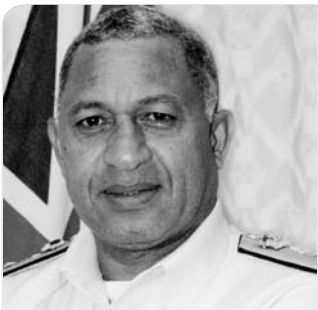
Commodore Josaia Voreqe Bainimarama OSTJ, MSD, jssc, psc

It is one year since His Excellency the President appointed the Interim Government to administer the affairs of the State.